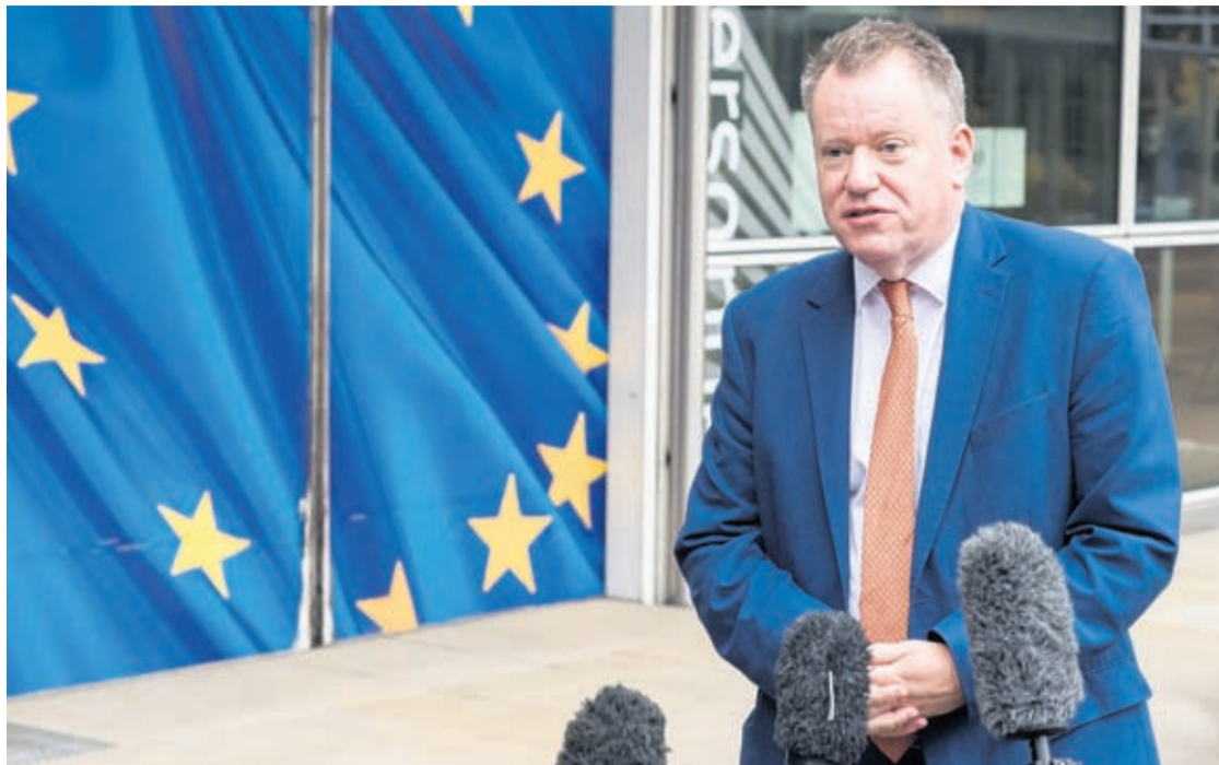
Britain's chief Brexit negotiator David Frost gives a media statement at EU headquarters in Brussels Nov. 19, 2021.

In a 13-point statement rife with complaints about perceived EU foot-dragging, ill will and sleight-of-hand in Northern Ireland, U.K. Brexit negotiator David Frost concluded: "It is disappointing that it has not been